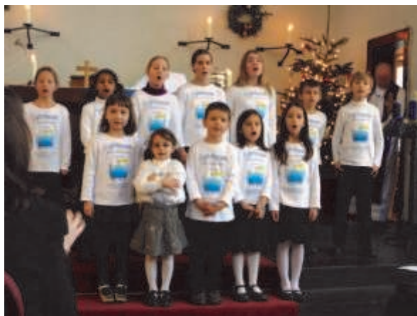
The joy of Christmas time was expressed musically by delightful presentations of the combined Little Lamps and Lamplight Kids choirs.