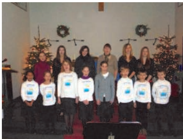
Trinity's choirs, Open Door, and Lamplight Kids, teamed up together to provide Advent and Christmas Eve music for services in December.