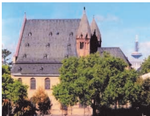
St. Leonhard's church in Frankfurt.