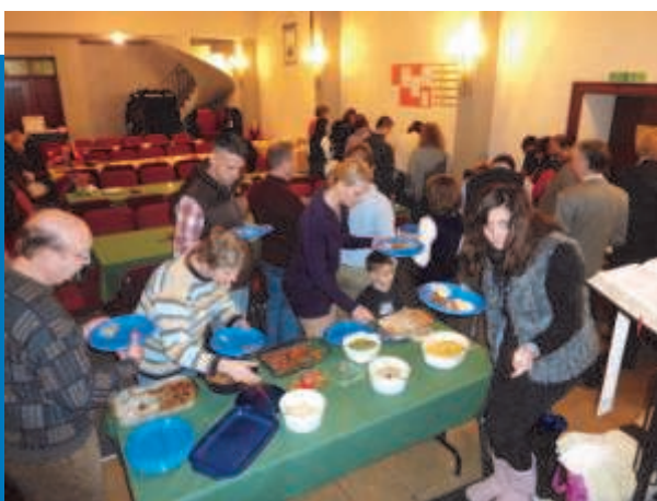
Happy to celebrate Thanksgiving together on November 28, parishioners enjoyed a variety of tasty delights.