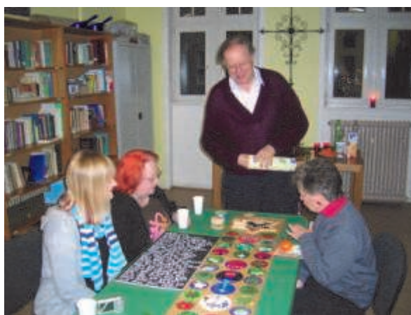
In the middle of the exciting game.