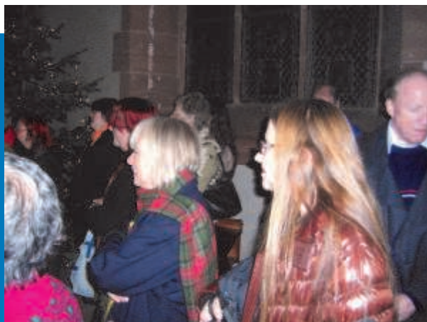
Final E.A.T. event of 2009 saw interested participants, including a contingent from Trinity Lutheran, viewing the historic nativity scene at St. Leonhard's Roman Catholic Church in Frankfurt.