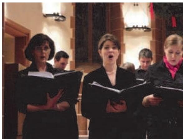
Beautiful descants sung by Sanctuary Choir sopranos provided a distinctive Advent feeling to the service on December 12.