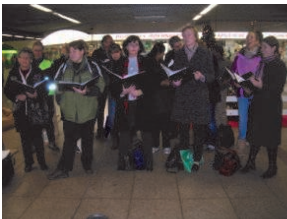
Full of Christmas cheer and caroling voices were members of the Sanctuary Choir performing traditional English-language carols intended to benefit the Bahnhofsmission on Thursday, December 10.