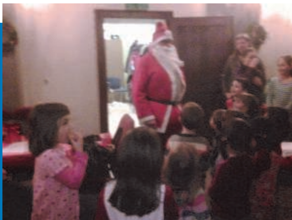
Boys and girls attending Trinity's Lighthouse activities on December 4 weren't naughty but nice since Santa had already checked his list twice. The afternoon event saw a bag of goodies set to please even the youngest.