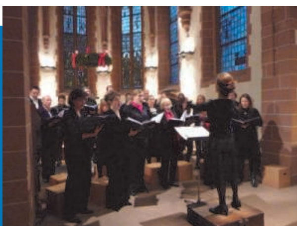
The Advent Vesper on December 12 in the Alte Nikolai saw a packed house of worship with standing room only.