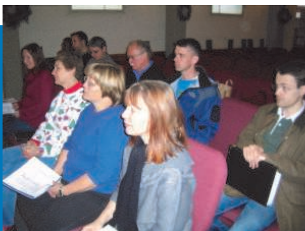
Improving breathing techniques to benefit singing output were part of the day's events.

schedule, found time to accompany the choir on the piano. The choir music for the December 6 worship service included descants to “Come, Thou Long-Expected Jesus”, the Lamplight Kids and Little Lamps singing “Christmas Lullaby Calypso”, and Lamplight Kids and Open Door Choirs performing “A Soft Wind Blew”.