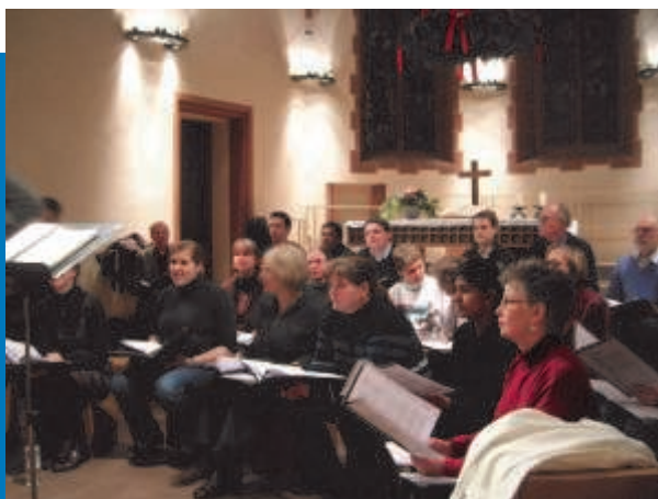
Choir and soloists during a Thursday dress rehearsal prior to the Advent Vesper on December 12 in the Alte Nikolai church.